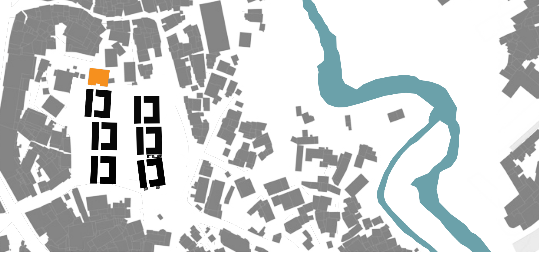
Phase 15 : Activate existing Armenian houses with a new public function

Phase 11 :Migrate existing residents immediately to new Affordable housing with maintaining community networks