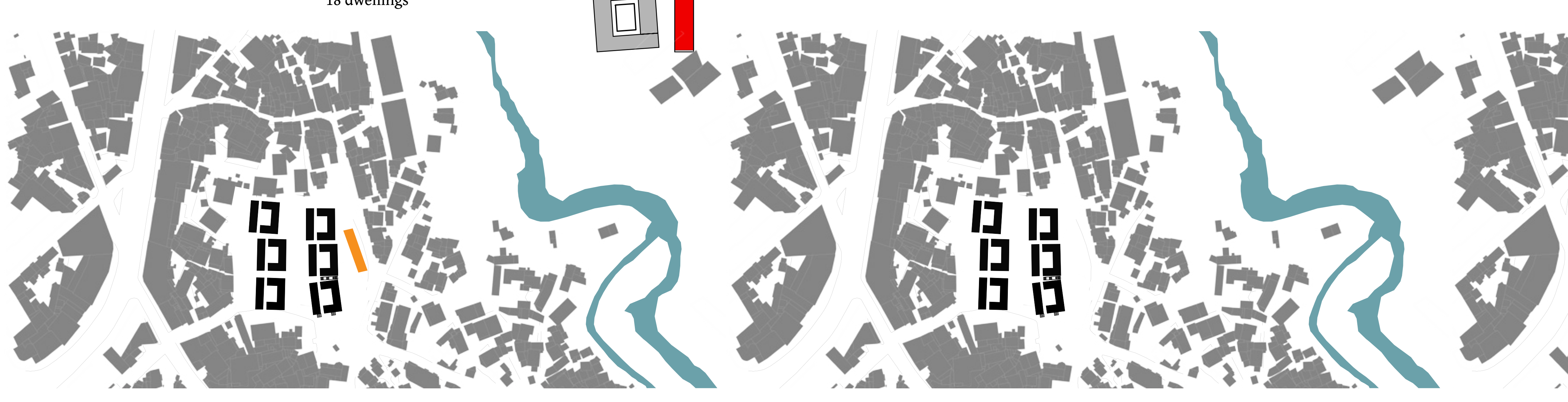
Phase 13 : Repeating the steps 11 until 13 For further developments