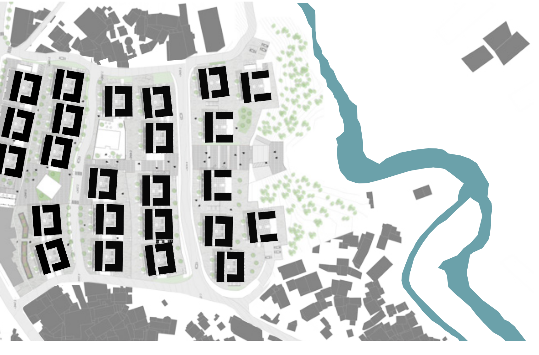
Phase 18 : Starting with valley, Open blocks and public amphitheater

Phase 11 :Migrate existing residents immediately to new Affordable housing with maintaining community networks