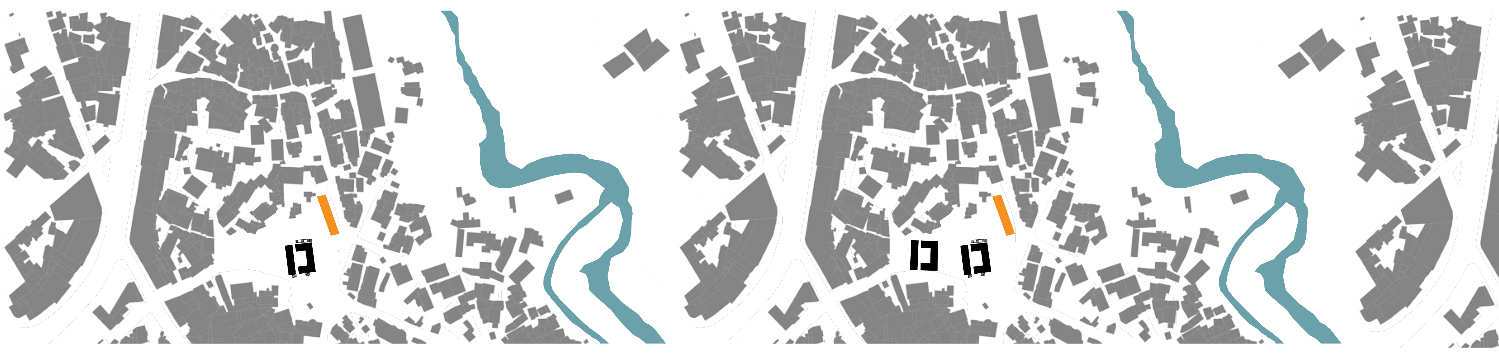
Phase 9 : On the free open space Building new affordable housing through the residents and public space with help from experts. 18 dwellings