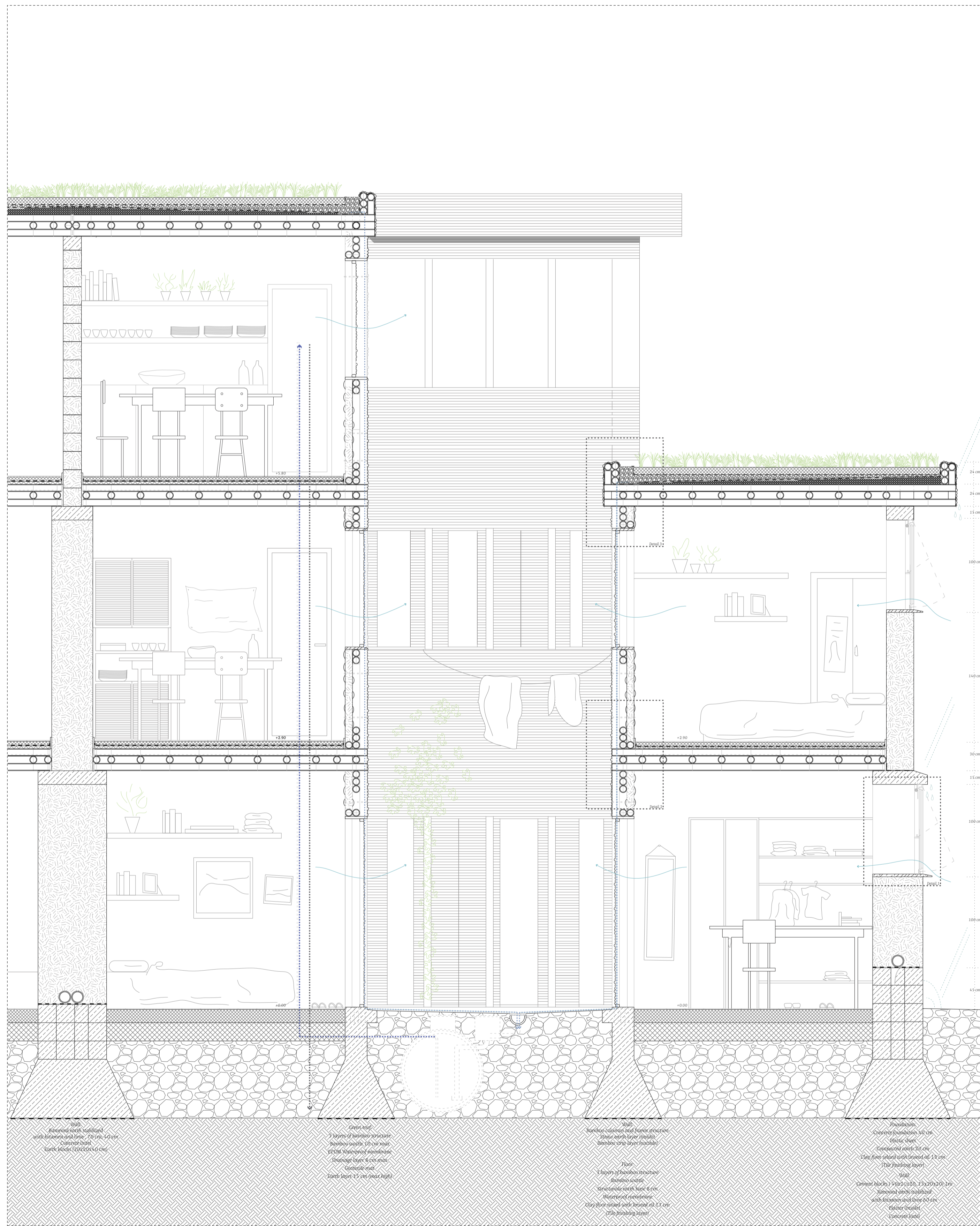
Construction detail 1:20 Vertical section Courtyard typology