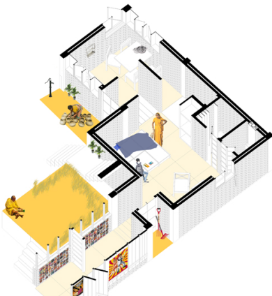
Flexible grids : Connection with street