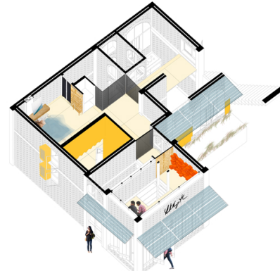
Flexible grids : Addition of sun shades