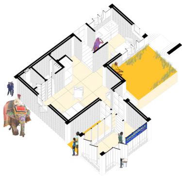
Flexible grids : Connection with street

The house is bound to grow and the extent of change is projected. In instances, people are projected to add walls, alter opening sizes, nature of windows, color schemes, spatial arrangement, sizes of the domestic spaces, add shading devices, add doors but in all cases even in the most disruptive ones, the underlying layer of design ideals are observed as resilient