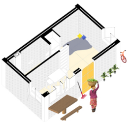
Flexible grids : Connection with street