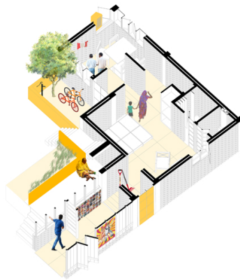
Flexible grids : Conenctions disrupted, spaces appropriated