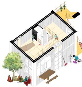
Flexible grids : Conenctions disrupted, spaces appropriated