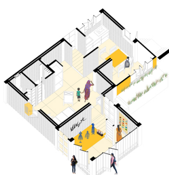
Flexible grids : Expansion of the shops