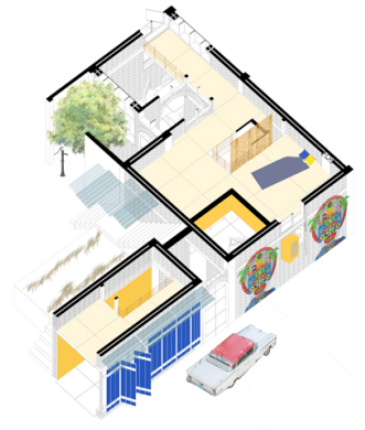
Flexible grids : Graffiti on the wall