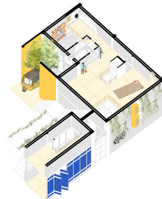
Flexible grids : Color of the shops