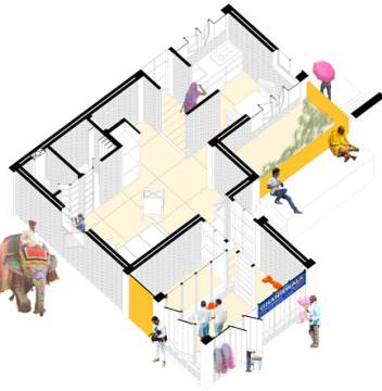
Flexible grids : Conenctions disrupted, spaces appropriated