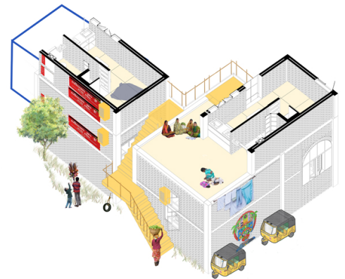
Flexible grids : Shared spaces